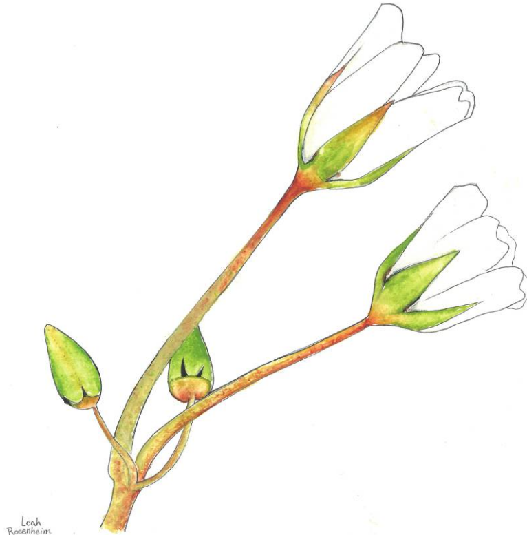
Limnanthes douglasii ssp. rosea male-sterile morph.